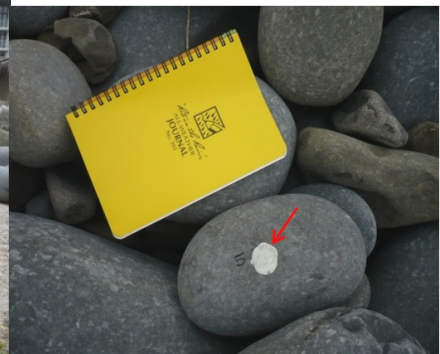
Left and Right : Red arrow is pointing to a tagged rock. A5 notebook for scale.